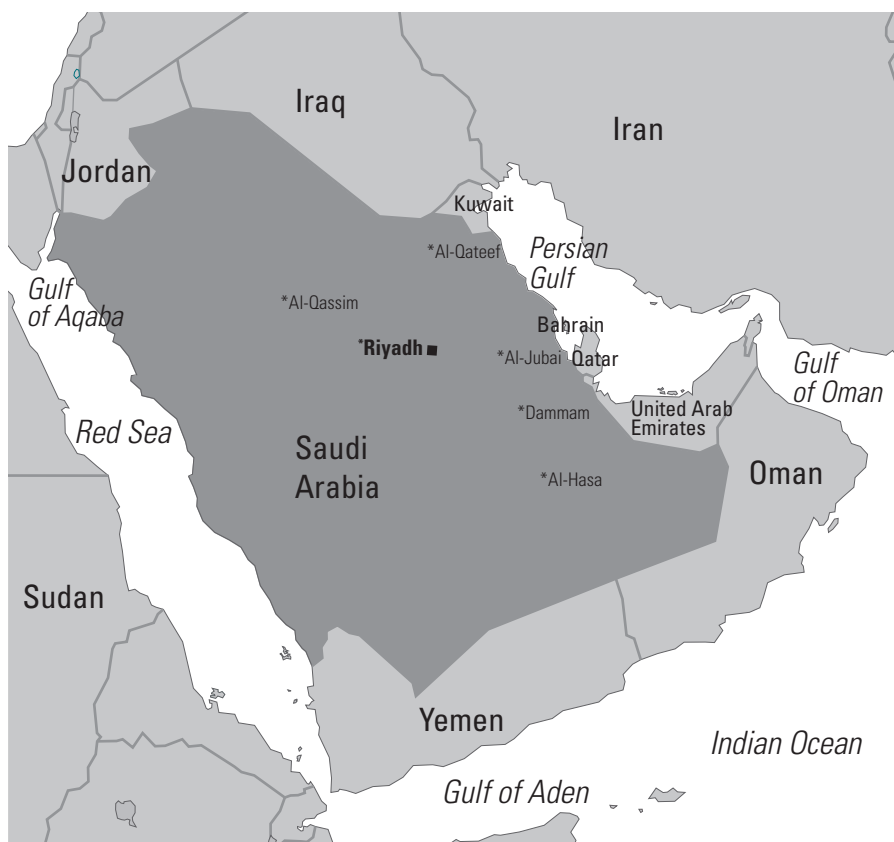
Fig. 1 Map of Saudi Arabia showing the geographical distribution of the collected samples

The whole blood samples (103) were collected from animals via venepuncture. Blood was collected in tubes containing ethylene diamine tetra-acetic acid (EDTA), and gentle shaking was applied to mix the whole blood with the EDTA. Samples were transferred on ice to the authors' laboratory. The whole blood was processed as previously described by Oladosu et al. (21). Specifically, the whole